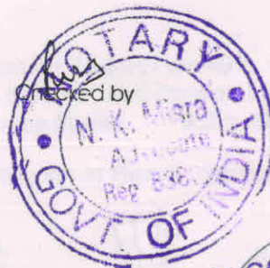
PHOTO-STATE COPY ATTESTED