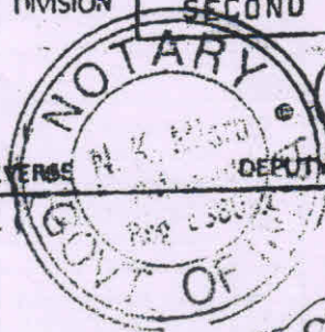
PHOTO-STATE COPY ATTESTED

NOTARY PUBLIC RAJSHAHI City (Raj.), INDIA